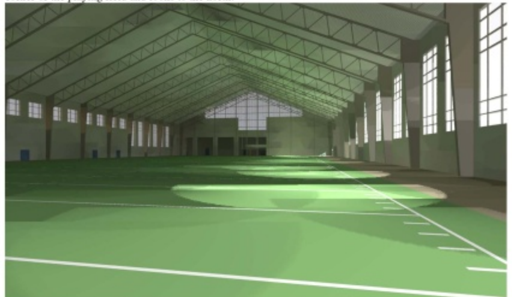
Figure 2: Light-diffusing IGU glazing